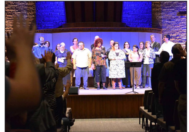
Members of FaithWorks graduating class 36 receive a blessing at Highland Church.

Six members of FaithWorks of Abilene's 36th class graduated in early May and are venturing out into the world with new determination, resources and our prayers. Applications are being accepted for a new class, because the FaithWorks ministry isn't finished. Do you know someone who is ready for FaithWorks?