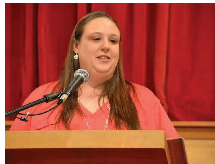
Magnificent Meg offers a graduation address.