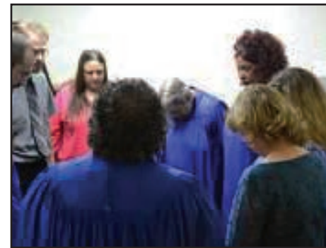
Members of class 36 pray together during their graduation ceremony.